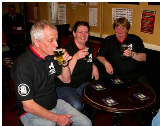
The Sign of Spring Toast

Butcombe, Bitter 4.0% Otter, Otter Ale 4.5% Stonehenge, Sign of Spring 4.6% Hopback, Summer Lightning 5.0% Abbey Ales, Bellringer 4.2% Cotswold Spring, Winter Royal 5.8% RCH, Pitchfork 4.3% Moor Beer Co, Old Freddy Walker 7.3%