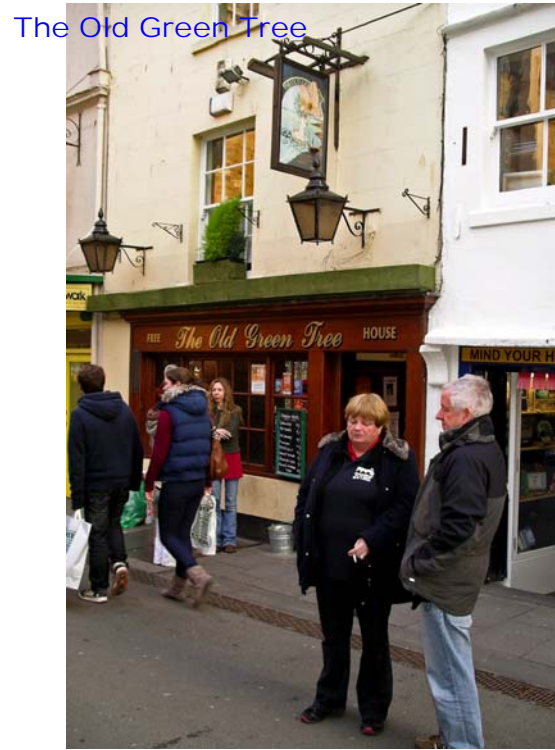
The Old Green Tree