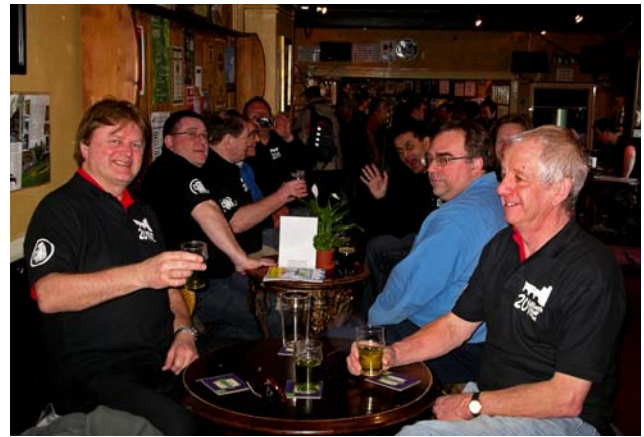
Group in The Bell