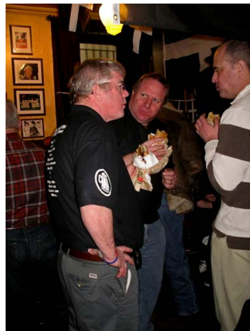
Time for a Pasty?