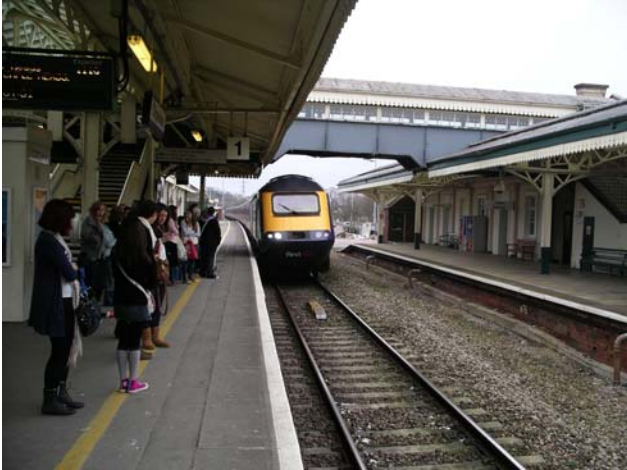
11:10 to Bath, a good old HST

Group Saver day returns cost £2-40 each, bargain!