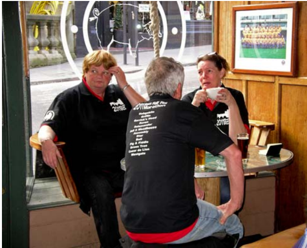
Our favourite table