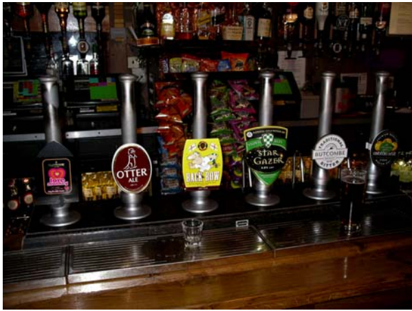
Pumps at The Pig