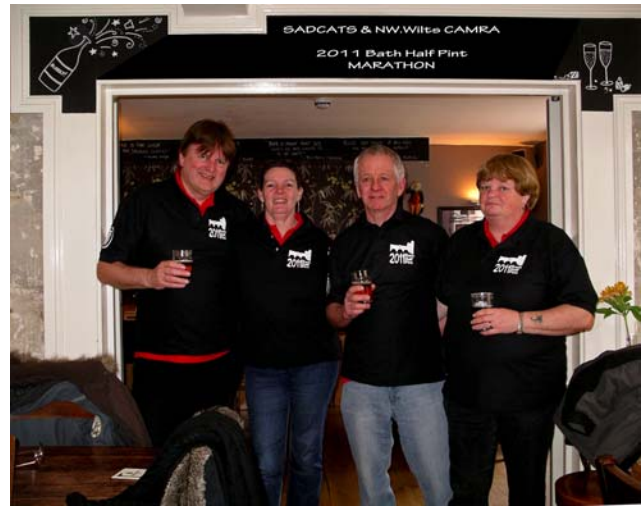
SADCATS at The Griffin.